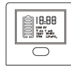
Pic 1 圖1 Fig. 1 dessin 1 Pic. 1 Foto 1 Bild 1